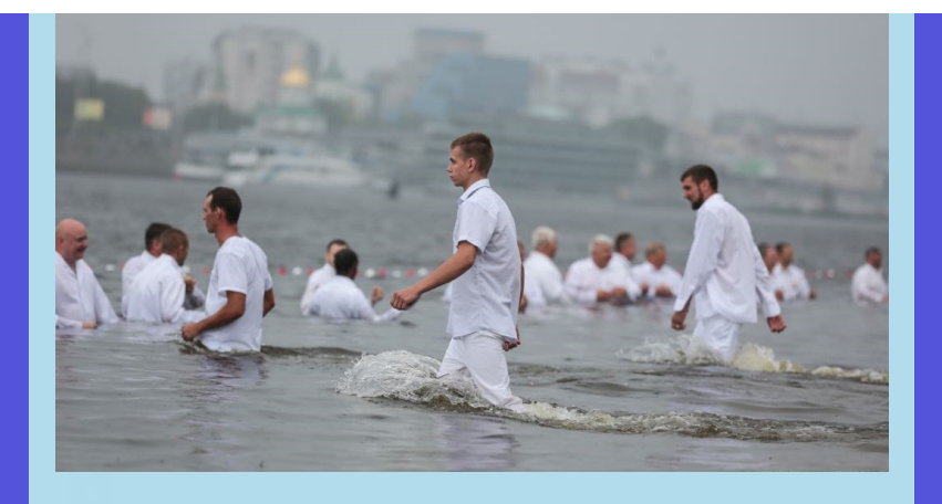
Ukrainian Churches held the massive Baptism in the Dnipro river in Ukraine's capital on the occasion of the 1030th Anniversary of the Baptism of Kyivan Rus-Ukraine.