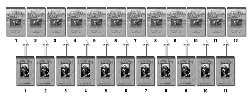
A Call to Growth one-to-one training