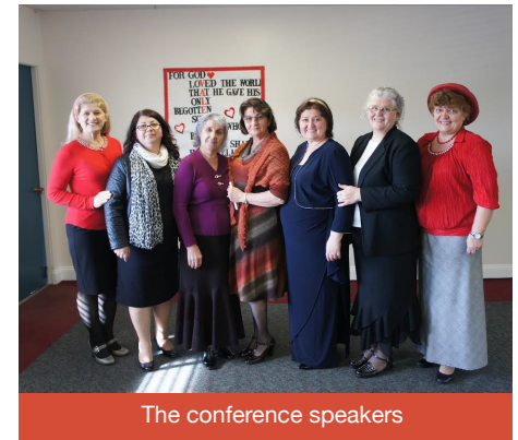
The conference speakers

Read the full version of conference notes on the Pacific Coast Association's website (in Russian only): "Women's Conference in Castro Valley."