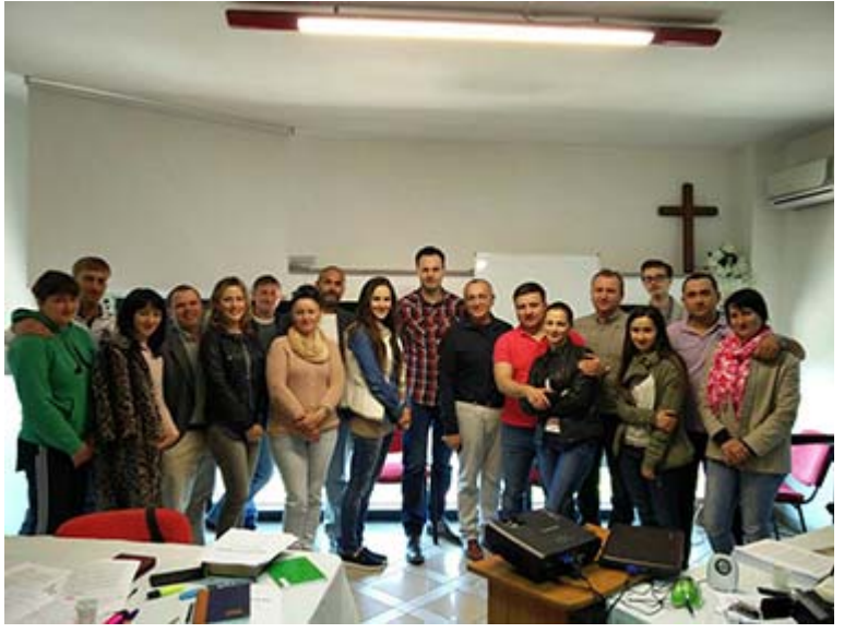
The Students and Teachers

Please pray for this program and its students.