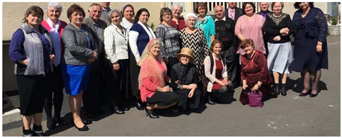
After the Women Conference