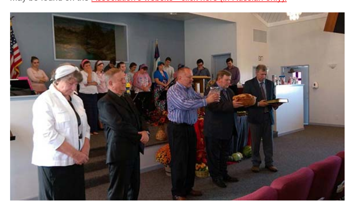
THREEFOLD CELEBRATION IN GRACE FAMILY CHURCH

A small church in Yuba City has been blessed to celebrate Harvest with many guests in attendance. Singers and orchestra from the church located on Franklin Blvd, Sacramento made the celebrations specifically sparking. More about this celebration may be found on the <u>Association's website - click here (in Russian only).</u>