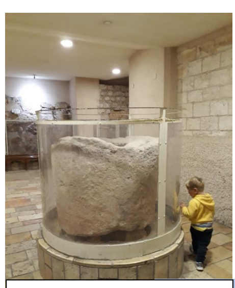
One of the stone water pots in Cana of Galilee