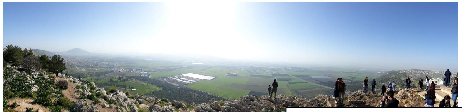
View of the valley of Armageddon in Galilee