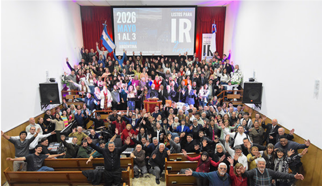
Group photo of all the congress' participants

Argentina, which took place on May 1-3 in Buenos Aires, the capital of Argentina. The theme of the congress was: “Are You Ready to Go and Act?” The main emphasis was on evangelism and missions. For more about the trip, read the information at this link.