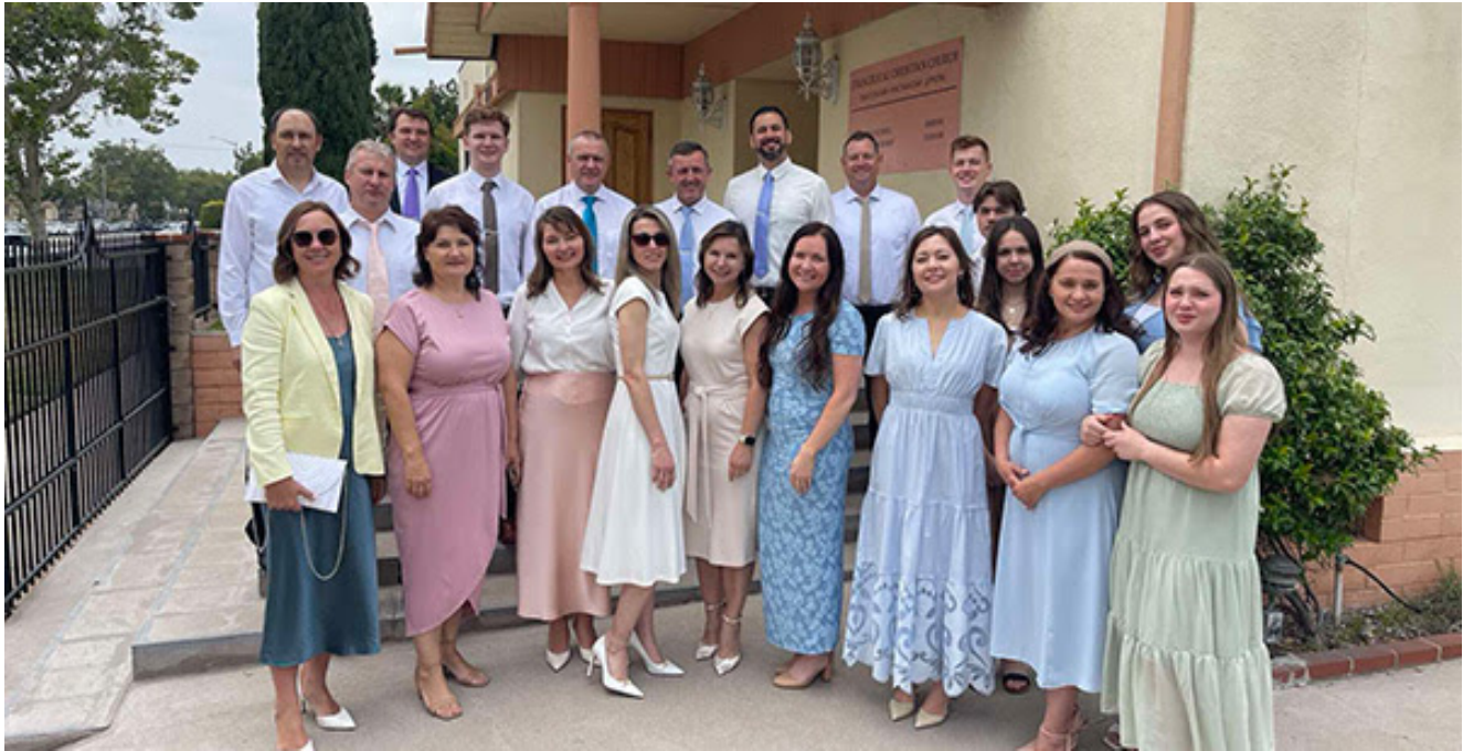
"Credo" choir at the church in Montebello