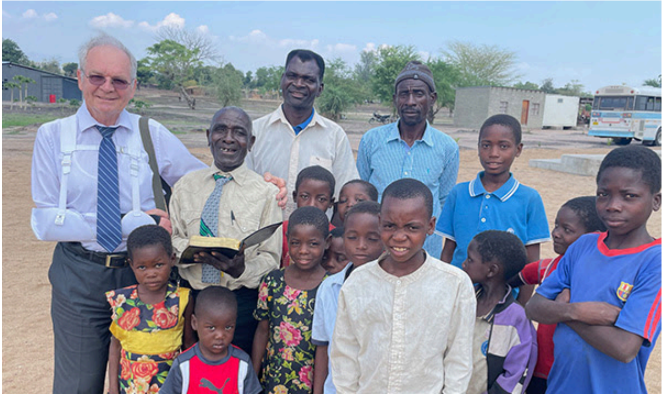
Serving among the people of Malawi